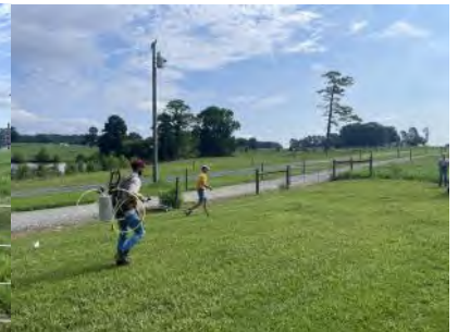
Students check their speed to meet spray at the correct GPA.