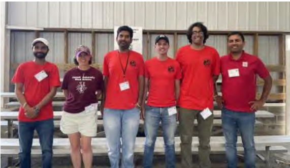
Cornell team and coaches.