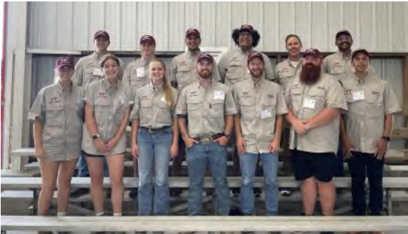
Teams from Virginia Tech took home 1st and 3rd place.