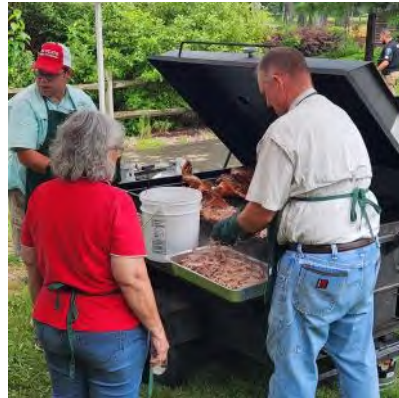
The Batts family prepared a traditional pig pickin'.