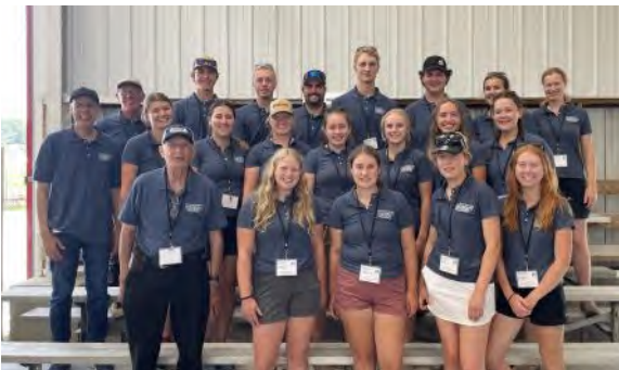
The University of Guelph brought 18 undergraduate students to the competition.