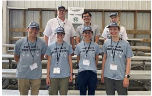
The Penn State team took home second place.