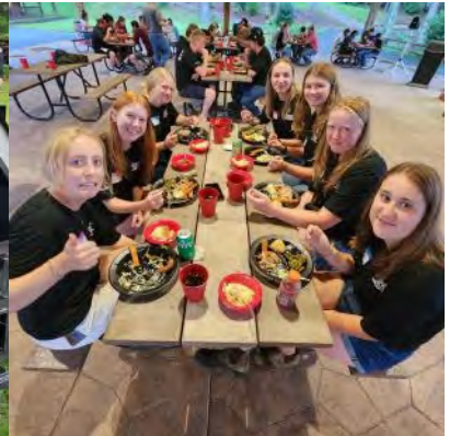
Students from Guelph were introduced to NC BBQ.