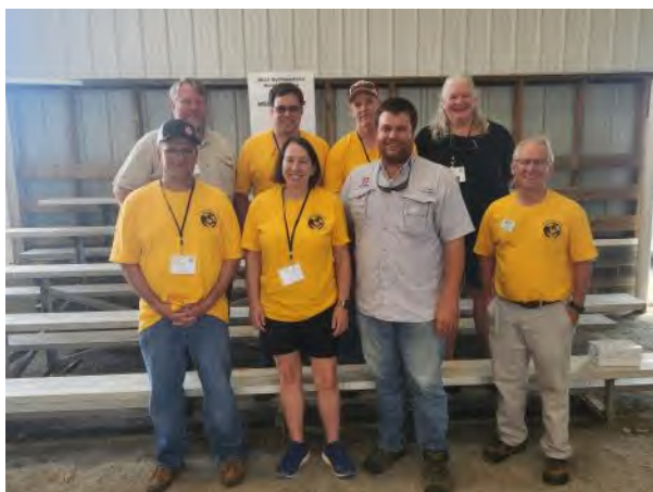
The planning committee insured the event was a success.

More information is in the NEWSS Summer Newsletter .