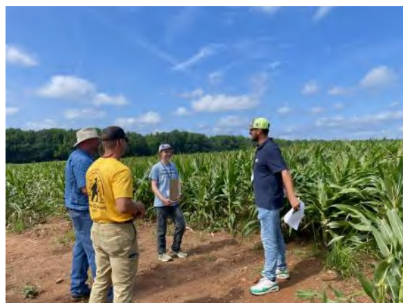
A student meets with our corn farmer to discuss options for a failed crop.