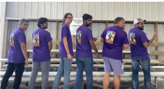
Clemson shows off their team shirts featuring The Tiger with a flamethrower.