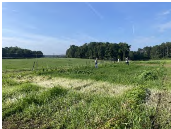
Students work on identifying herbicide symptomology.