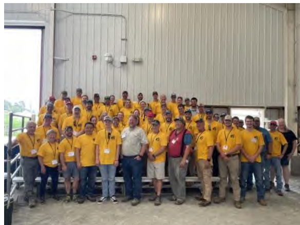
Over 73 volunteers were needed to host the event.