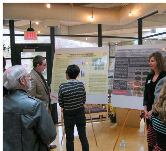
Student Poster Contest at the WSSNC annual meeting.